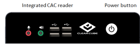
Microphone jack Headphone/speaker jack Four front USB connections