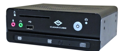
CD7924 w/ attached DVD player and mounting carriage