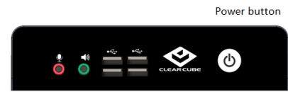
Microphone jack Headphone/speaker jack Four front USB connections