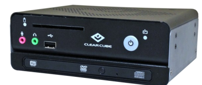
CD9922 w/ attached DVD player and mounting carriage