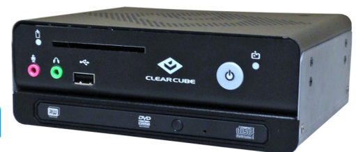
CD9924 w/ attached DVD player and mounting carriage