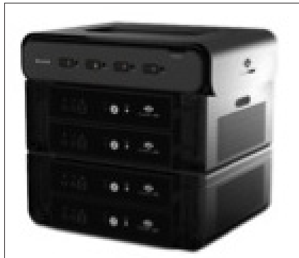
Figure 3: ClearCube Client Cube

ClearCube's ClientCube is the first endpoint that consolidates multiple networks into one device at the desktop, while maintaining physical network separation to centralized computing resources in the datacenter. VMware View and BladePC workstations can be isolated and secured in the datacenter without compromising the user experience or network security at the desktop.