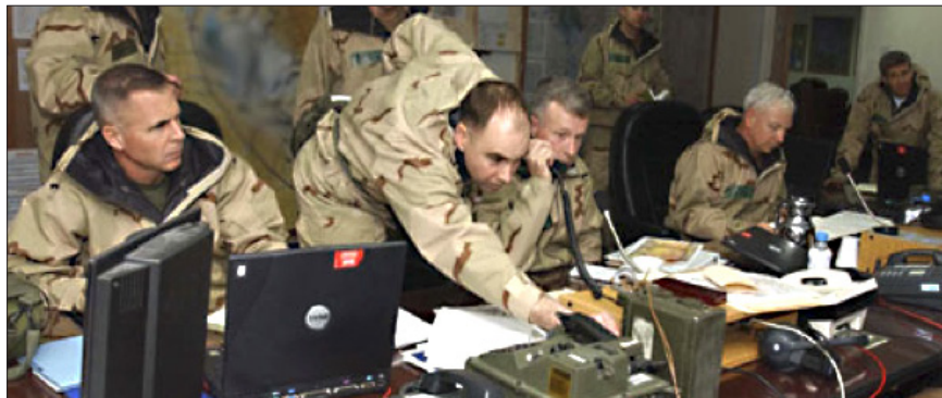
Figure 1: Collaboration is more important than ever—but more interaction leads to more networks, computers, monitors, and other devices on the desktop, resulting in higher costs and risks.

From an end user perspective, the result is a cramped workspace loaded with hardware: multiple computers, monitors, radios, and other devices on and around the desk. This “desktop sprawl” also introduces new challenges for the IT department; management becomes more complex, time consuming, and error prone, resulting in higher costs and sometimes leading to “spillage” of sensitive data.