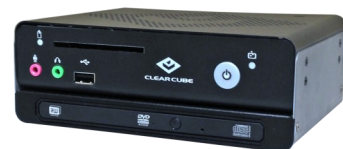
CD1024w/ attached DVD player and mounting carriage