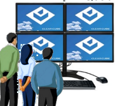
ENGINEER / DESIGNER USERS