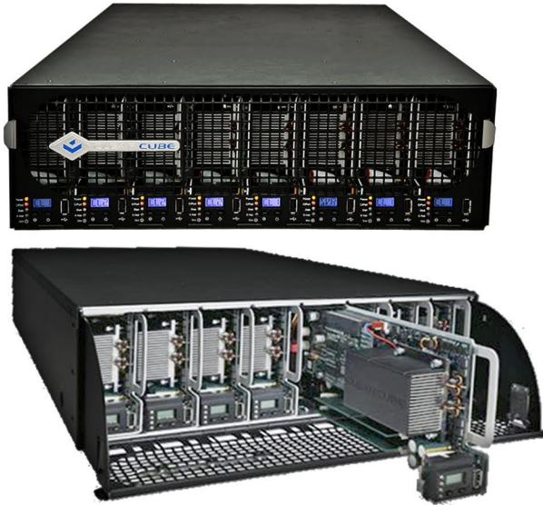
R4300 Blade PC Chassis

A standard 42U, 19-inch rack can hold as many as 14 chassis, for a total of 112 single-user Blade PCs. Each R4300 chassis includes three configurable bays that provide connection and networking functions.