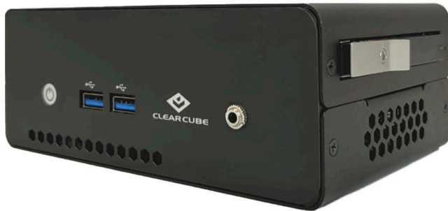
DTi7122/42-R NUC Mini PC

With mighty performance & compact form factor, it's a dedicated desktop solution.