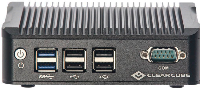
Thin Client CD8840