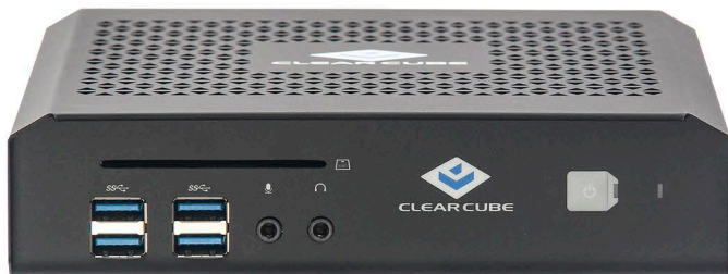
Thin Client CD8842-44