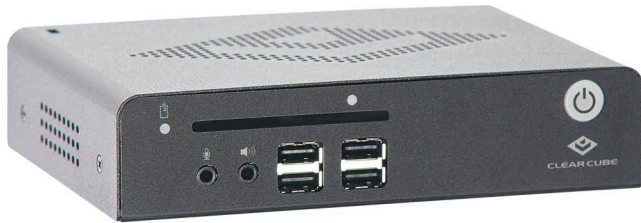
Zero Client CD2024

Future proof your display options Dual DisplayPort, Copper Zero Client, 6 USB Ports and an Integrated CAC Reader