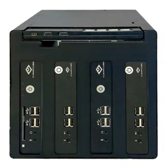
ClientCube NET-4 SFF Multiple Security Domains